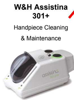
W&H Assistina 301+ Handpiece Cleaning & Maintenance