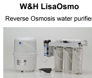
W&H LisaOsmo Reverse Osmosis water purifier