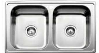
Modwood Rinse & Wash Double Sinks

For all your requirements - Design - Equipment - Cabinets -