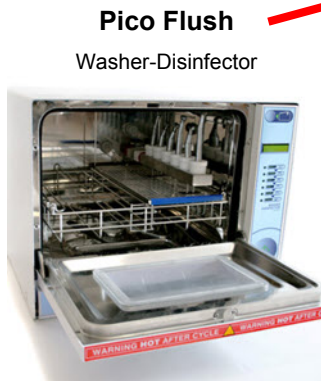
Pico Flush Washer-Disinfector