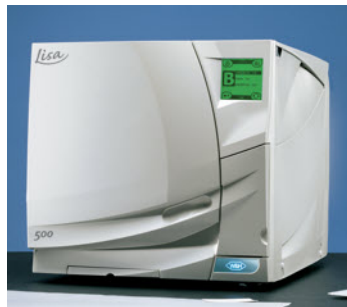
W&H Lisa MB-517 Vacuum Autoclave