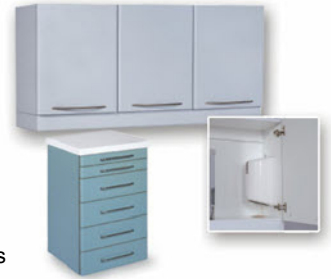
Modwood Clean Area Storage Cabinets